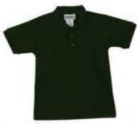
Green Polo Shirt with Collar

Our school community has set high standards for appropriate attire and personal cleanliness. Below are the required uniform guidelines: