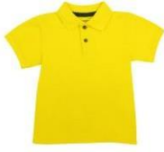
Yellow Polo Shirt with Collar